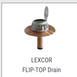
LEXCOR FLIP-TOP Drain