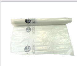
LEXCOR PE-10 VAPOUR BARRIER