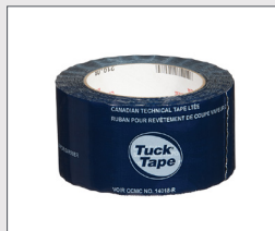
BLUE TUCK TAPE