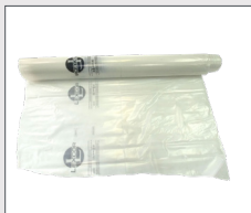
LEXCOR PE-10 VAPOUR BARRIER