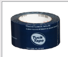
BLUE TUCK TAPE